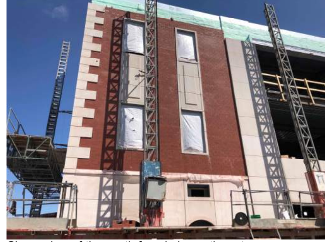
Closer view of the south façade in southwest corner.