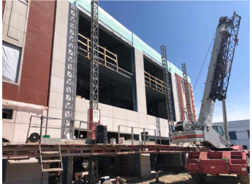
View of curtainwall openings on south façade.