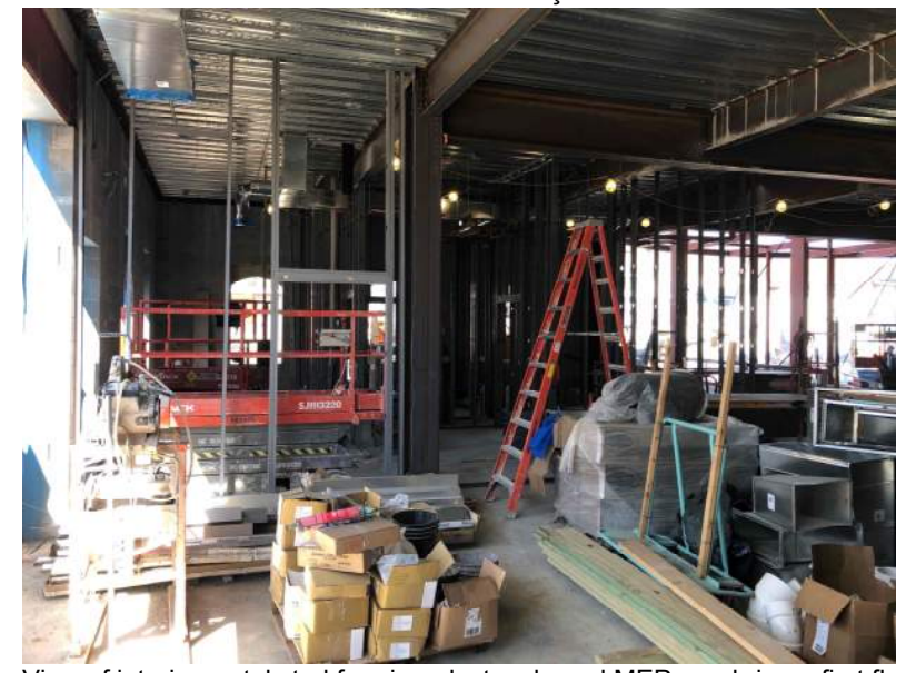
View of interior metal stud framing, ductwork, and MEP rough-in on first floor.